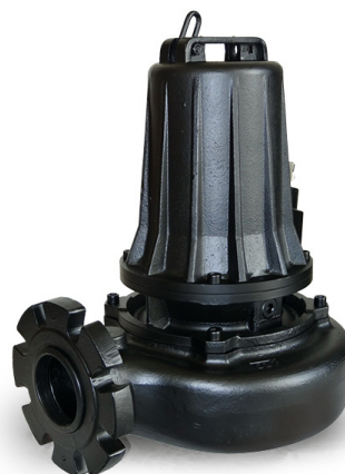
Attention: pictures for illustrative purposes

Tolerance according to ISO 9906:2012 3B2